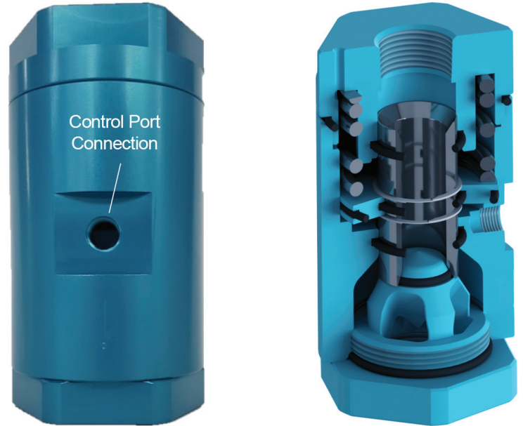
SENTINEL Normally Closed Shutoff Valve